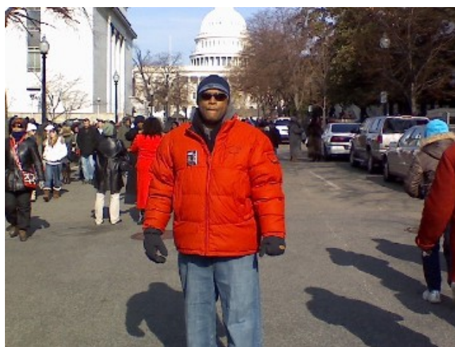
Jan. 20, 2009 - Local 592 Civil Rights Chair, Collier Holleman stands with the Capitol Building in the background as Barack Obama prepares to be sworn in as the 44th President of the United States.