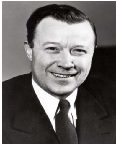
Walter P. Reuther, UAW President from 1946 to 1970

Walter Reuther was recognized as a labor leader of national stature when he led a strike against General Motors at the end of 1945. Autoworkers