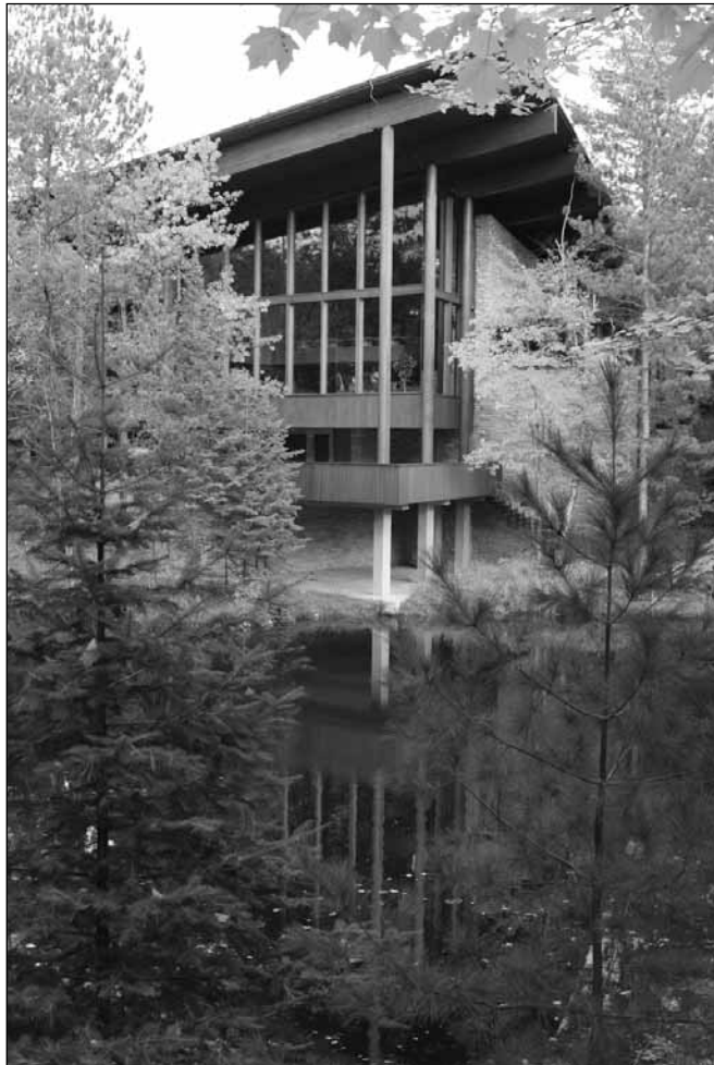
The Walter and May Reuther Family Education Center.